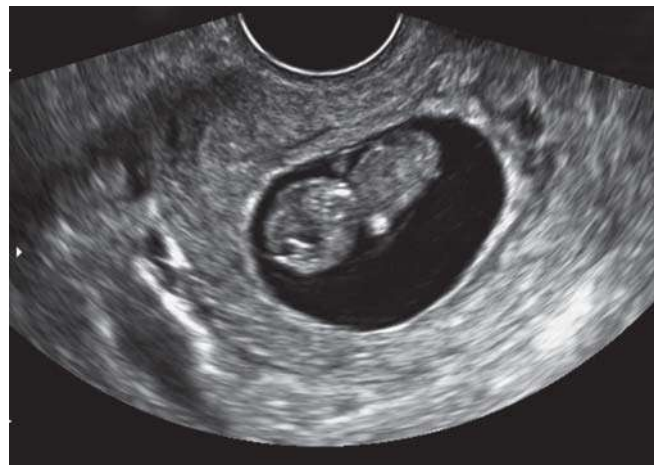
Fig. 3: Transvaginal ultrasonography showing ongoing viable intrauterine pregnancy

Transvaginal ultrasonography is an important aid in the diagnosis of heterotopic pregnancy, but ultrasonographic identification of ectopic pregnancy is low in its sensitivity. 8 Some findings, such as extrauterine gestational sac with fetal cardiac activity, fetal node, and hyperechogenic ring surrounding the gestational sac and adnexal mass, point to tubal heterotopic pregnancy. Suspicious adnexal masses can be investigated with Doppler ultrasound in an attempt to improve sensitivity and specificity. Taylor and coworkers have described