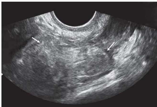
Fig. 1: Transvaginal ultrasonography showing inhomogeneous hyperechoic mass (white arrows) in the right adnexa

Heterotopic pregnancy should be kept in mind even if an intrauterine pregnancy is diagnosed and one should take extra